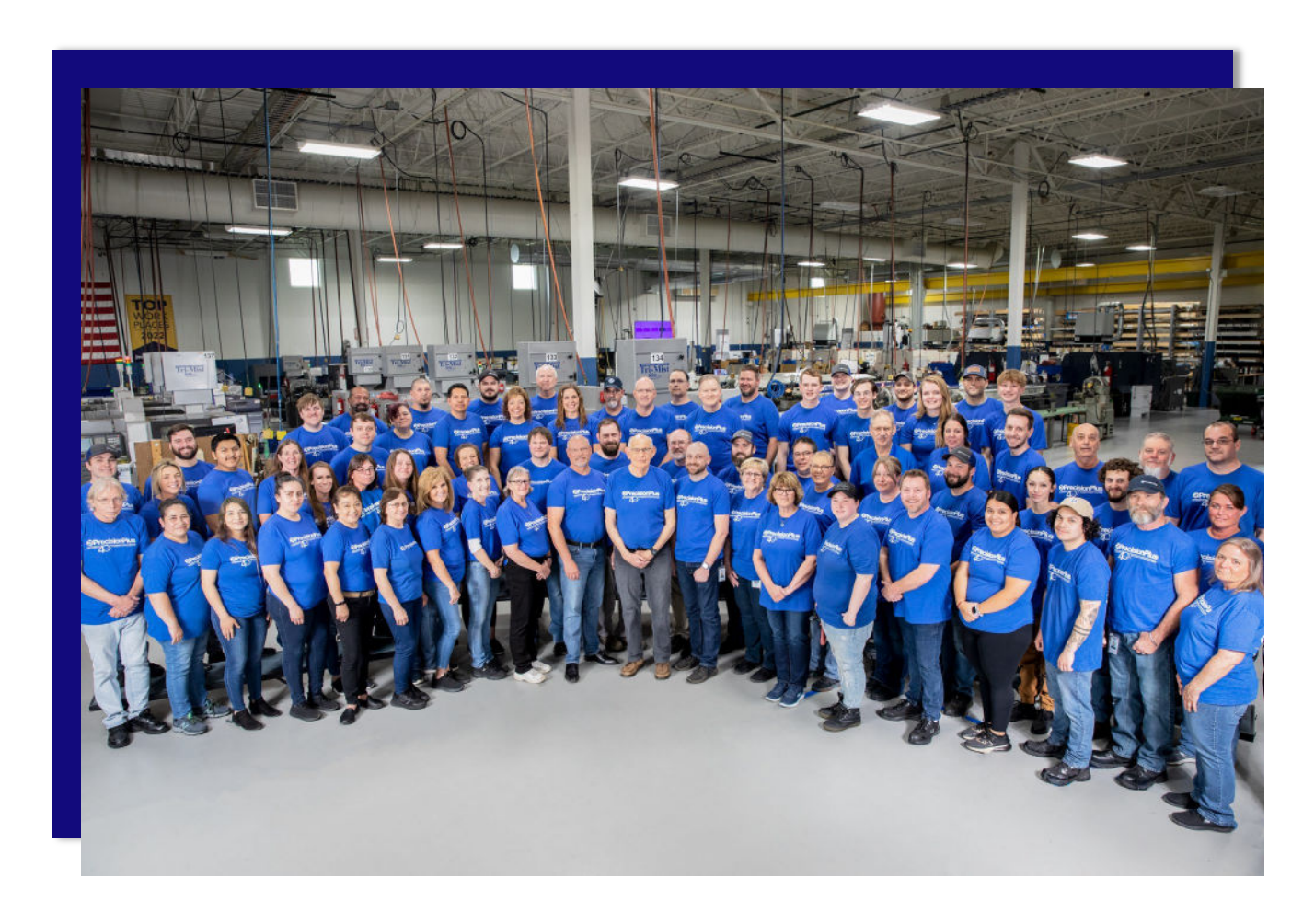
2023 COMPANY PORTRAIT